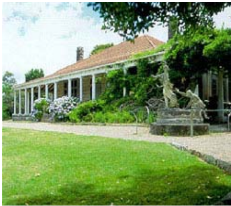
One of the world's best loved book is the Magic pudding written & illustrated by Norman Lindsay.

Set in extensive grounds, the single storey house with its external painting and etching studios was the home of Norman Lindsay (1879-1969), one of Australia's most controversial, exceptional and prolific artists. It was here that he created etchings, oils, watercolours, sculptures, the fine ship models which he made as a pastime, and where he wrote the children's classic, The Magic Pudding .